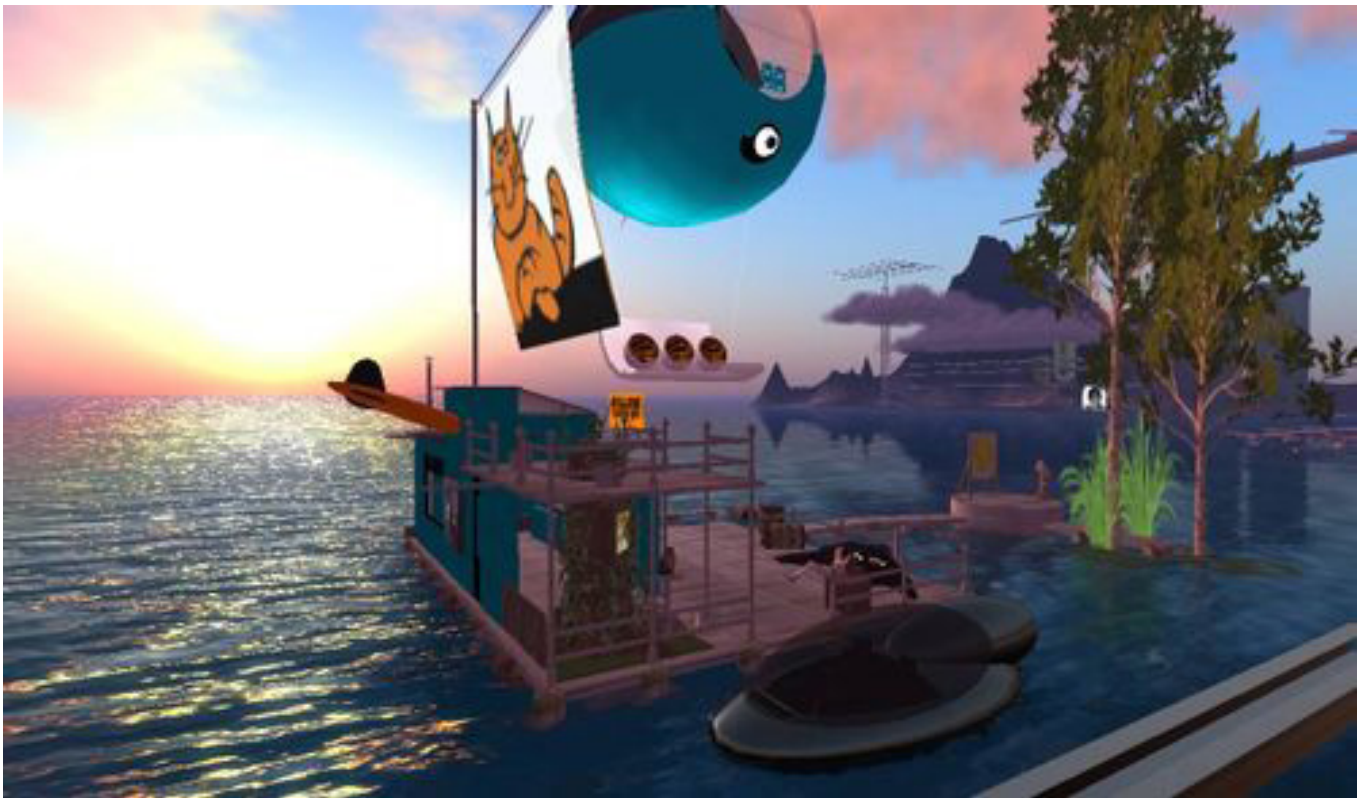
Chris Marker's virtual home on Second Life, May 29, 2009.